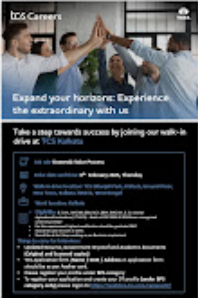
TCS BPS Mega Drive Poster.jpg 114K